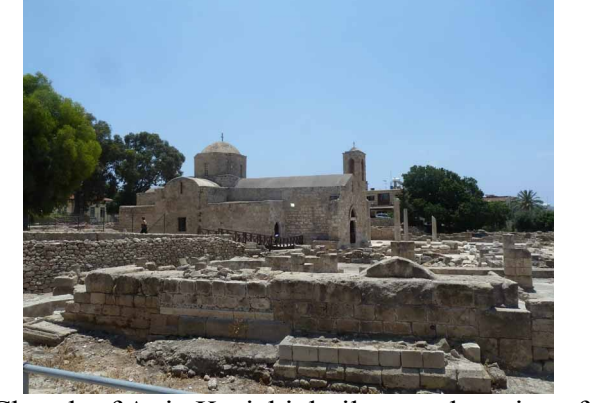
Church of Agia Kyriaki, built over the ruins of the largest early Christian Basilica in Cyprus