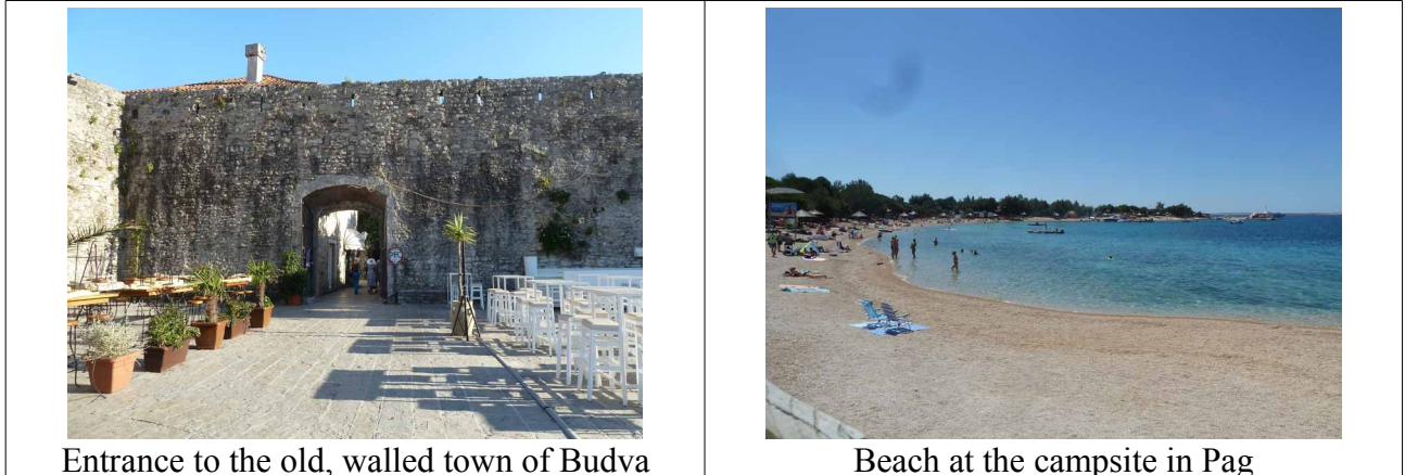
Beach at the campsite in Pag

After Greece the next place I wanted to stop at was Montenegro. So again I took buses. From Vrasna to Thessaloniki, then another night bus from Thessaloniki to Shoder in Albania, then a bus to Ulcjin in Montenegro, then on to Budva. This time it was to see someone whose only contact details I had were her name and "when you come back, visit the Irish bar, they know me there". I was not even sure I could remember what she looked like. She had written a prayer on a paper napkin and given it to me and asked me to put it in the Western Wall in Jerusalem. I carried it and placed it there for her and said a prayer. I had photo'ed where I had put it and finding a place that printed photos, printed off the photo of the Basilica at Gethsemane where I had also prayed for her, and the candle I had lit and the photo of her prayer in the Western Wall. I found the bar OK but alas she was away during the week studying. But the girl serving behind the bar remembered me and promised to deliver the photos with a note to her.