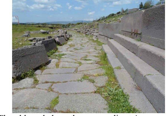
The old road along the necropolis at Assos.

After Assos my journey continued along the coast within sight of the sea and more opportunities for camping nearby. At one campsite I had a breakfast that was so beautifully presented I had to photo it! Even the tomatoes were peeled.