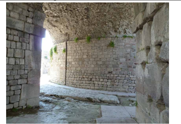
Circular treatment centre at Asklepion

So I have been steeped in ancient history for the past while. The next place I am really looking forward to visiting is Ephesus. And much to my delight, two friends are coming out to meet me at Izmir and will walk with me from there to Ephesus where we will stay for several days.