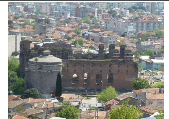
The Red Hall – one of the Churches mentioned in St John's Revelations. The circular structure to the left in the picture is now a Mosque.

The following day I took the opportunity to visit a huge site devoted to healing. It is situated on the plain below the main ancient city. At it can be found temples dedicated to Asklepios, the Greek god of medicine, Hygieia, his daughter as well as a temple to Apollon, his father. There is also a huge treatment centre catering for both physical and psychological problems. Treatments included dream interpretation carried out by priest doctors, mud baths, blood letting and herbal remedies.