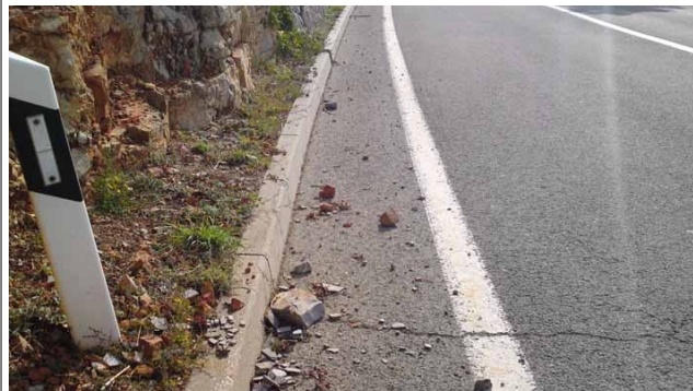
Great views, sheer drops and no barrier!