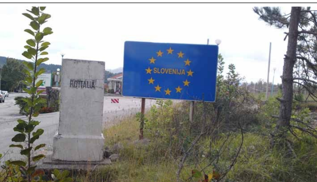
Crossing into Slovenia