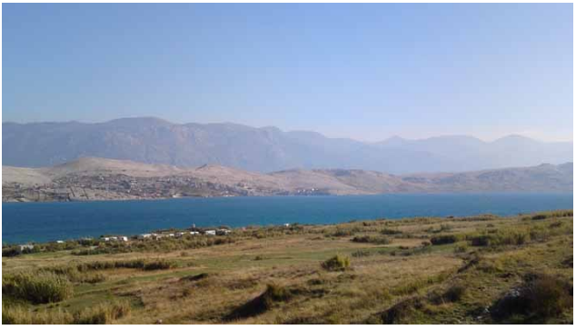
.... and stunning views

Yesterday I have a truly wonderful walk along a minor road that for much of it was actually a gravel road. No traffic, peaceful and quiet and stunning views. Such a gift after weeks of walking on roads with varying degrees of busy-ness. The City of Pag is also known as the City of Lace so I have acquired another adornment for my rucksack – a beautiful lace cross. And this rucksack? We're the best of friends!