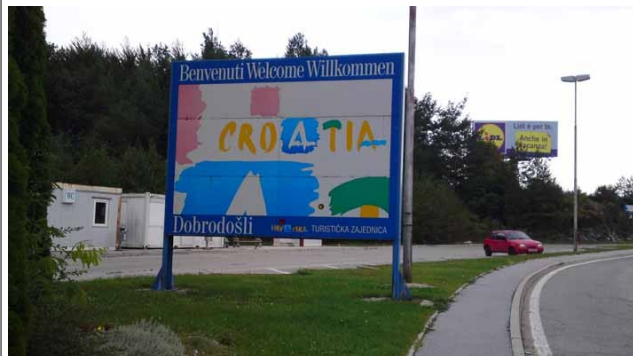
Pause for prayer at a roadside shrine in Slovenia | Crossing into Croatia

The road started descending and next day I was back at sea-level at Rijeka. Unfortunately by now it was clear that my new rucksack and I were not going to be friends! It was quite a bit heavier than my previous one and I couldn't seem to get it to fit snugly on my back. So I had a delay while I went shopping in Rijeka and bought another rucksack.