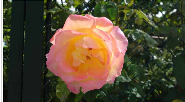
... and the beautifully scented real thing!