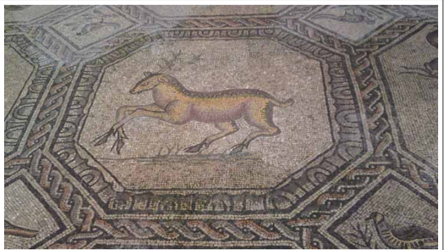
Mosaic floor at Aquileia .....