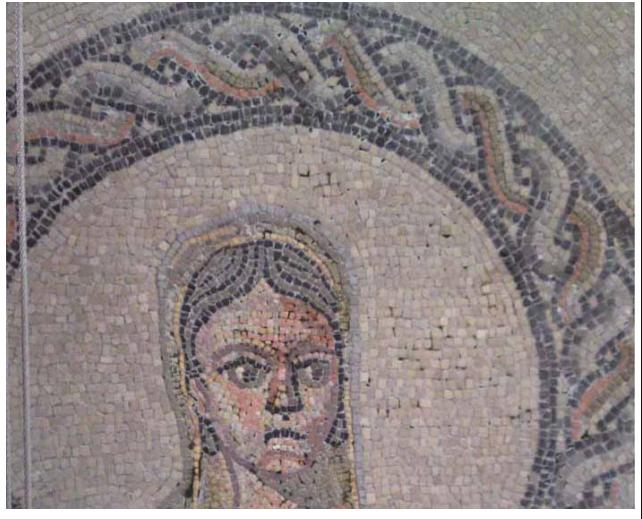
... another detail from the floor

Walking through the seaside towns (sorry, I'm jumping about a bit now!) it was hard not to be affected by a sense of frivolity, and then, on my way through one of them I had one of those "I want one" moments! There was a shop selling a huge variety of bunches of brightly coloured flowers - artificial of course - for just 1€ each. I had to have one. After spending an age choosing I eventually selected a lovely combination of blue and yellow flowers. I was very pleased with myself. When I went in to pay, I don't quite know how it happened but I ended up in conversation with the woman serving in the shop and another customer and telling them I was walking to Jerusalem and why. When she heard this, the woman serving said "You are close to my God. Will you pray for me please, I have cancer"....... I understood then why I had had the "I want one" moment