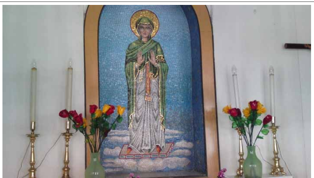
Pause for prayer at a beautiful mosaic shrine on Murano

Sadly it came time to leave Venice and continue my journey. I returned to the city but instead of retracing my steps back across the land bridge, I took the ferry to Punte Sabbioni which was the mainland continuation of the coast. It was not unlike the section after Ravenna, with miles and miles of sandy beaches, and a plethora of campsites. My progress slowed as I enjoyed the weather and opportunity for cheap accommodation. It was now the end of the season and prices were at their lowest. At Caorle another gap in the coastline and a frustrating lack of bridges or ferries forced me to go nearly 20kms inland before I could carry on eastwards to Trieste.