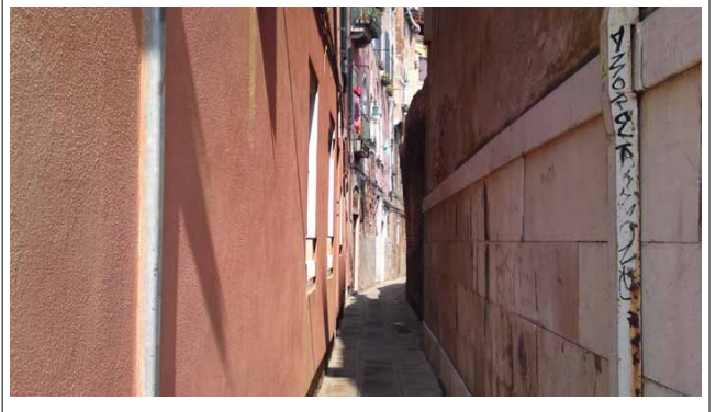
Some incredibly narrow streets .....