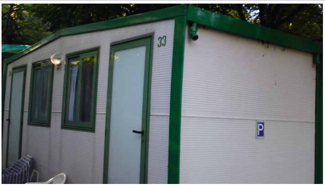
... and outside

Despite having 3 days to explore Venice, it just wasn't enough. It is such a unique city. I will have to go back. I bought a 2 day travelcard so I could go to some of the islands. Murano was very picturesque and on it was the beautiful Basilica dei Santi Maria e Donato. It originated in 7<sup>th</sup> C but was reconstructed in the 12<sup>th</sup>. It had a marvelous mosaic floor dating from that period. The island is now the centre for Venetian glass making and was dotted with sculptures of glass.