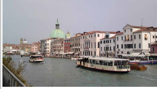
.... and of course the canals