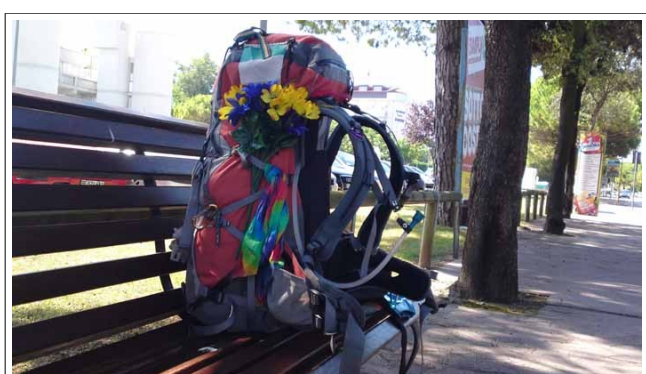
Cheerful artificial flowers .....

Below is a picture of my rucksack resplendent with its new decoration!