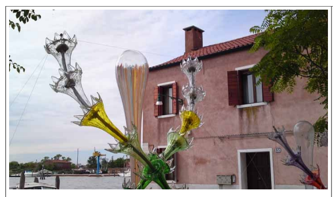
Glass sculpture on Murano