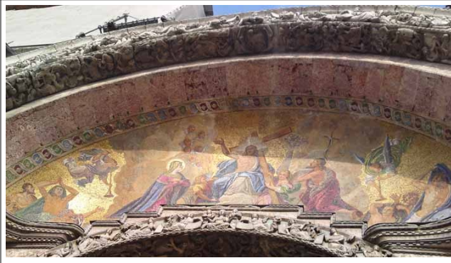
...to arrive at St Mark's Basilica for a stamp for my credential

I really liked Venice, it has a real buzz about it. And there was so much art. Also I was really lucky with accommodation. On the day before I arrived, I had hoped to camp wild but it was too built up. I saw signs for a campsite. It was getting late so I thought I would stay there 2 nights to make full use of it. The guy at reception was a bit dour. I picked my spot, put down the rucksack and then went to the camp shop.