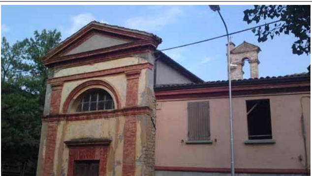
Pause for prayer at the old Church in San Columbano