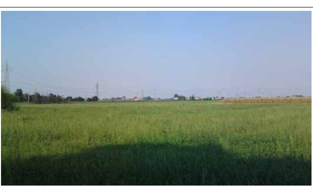
.... and hills give way to flat countryside