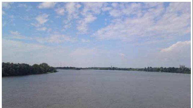
Halfway across the Po now

About halfway to the end of this section of the bridge I heard a noise. I stopped and listened. It was a miaow. I looked over to the other side of the road and there was a little ginger kitten, walking alongside the curb, the same direction as me, miaowing continuously. A lorry thundered past and the little thing was blown against the curb, almost off its feet. I crossed over and tried to pick it up whereupon it lashed out at me in fear and ran a few steps on. I caught up with it and blocked its way with my staff.