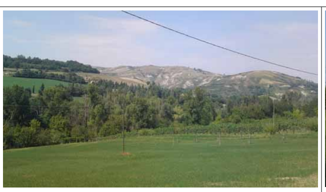
Mountains have given way to hills .......