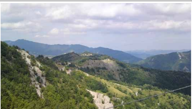
The view from the other side of the pass