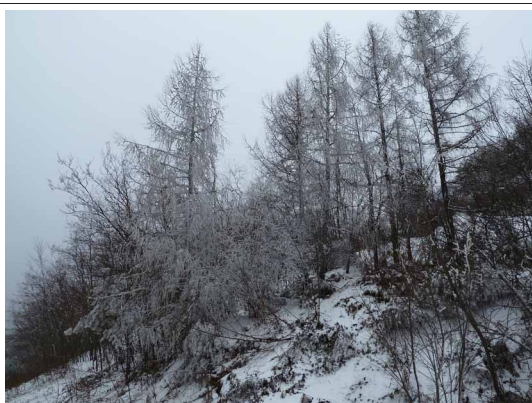
Another Christmas card?

This I did and was glad I had waited out the weather because the day I crossed the pass it was bitterly cold with low-lying cloud though no rain or snow. Soon I found myself in the snow line and by the time I reached the top of the pass I felt as though I was in a Christmas card!