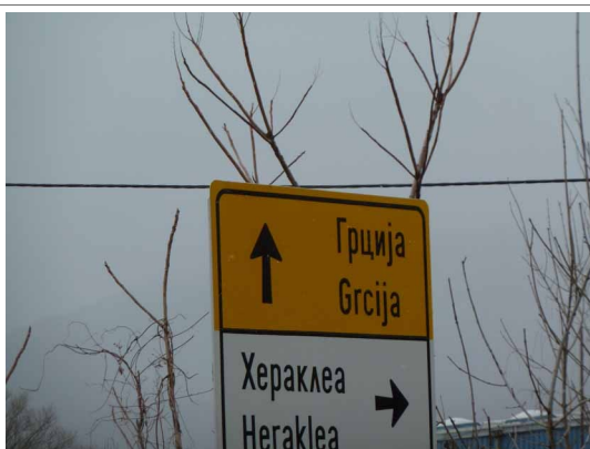
I hope this is saying "Greece, straight on"

Leaving Bitola the weather had worsened, colder and it was snowing lightly. I had no map of the route between Bitola and Greece so I rather hoped I was going in the right direction (remember how good I am at taking the 'scenic route'!).