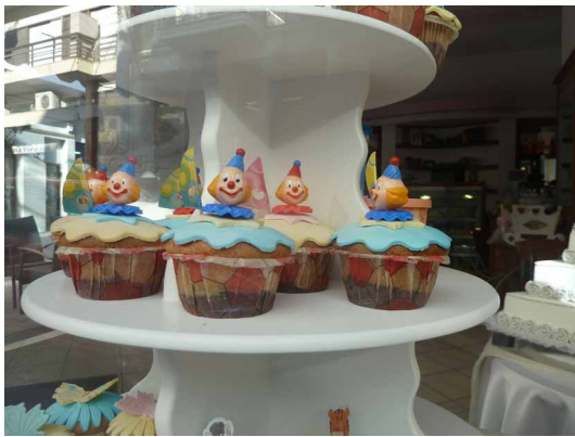
This was a cheerful sight on my way out of Giannitsa and no, I didn't stop and buy one!