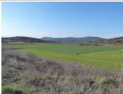
..... and as I leave the mountains behind & descend it gets warmer ..... or so I thought!

But as I approached Edessa the temperature definitely dropped and as I arrived it was down at 4 degrees. I found a hotel and within the hour snow was falling, big, thick flakes, the sort that don't melt. Later that evening when I looked out of my window, another Christmas card scene greeted me. Was I relieved I was in a lovely, warm, snug room.