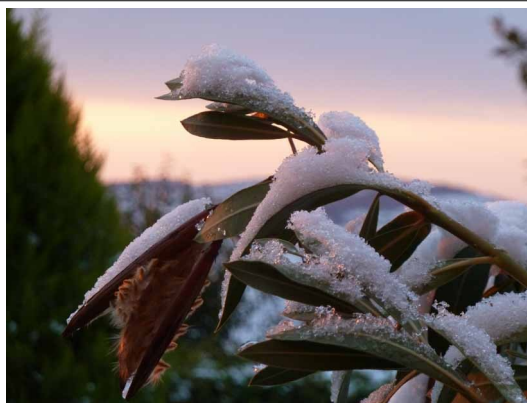
Dawn over snowy Edessa

Next day dawned with beautiful clear blue skies and sun. I had had a good rest and slowly my fitness was returning. Although I had descended to Edessa, on the other side of the town was another descent. It was definitely warming up and now I did not need my thermal 'long-johns'. Next day I walked without my thermal top and the day after with my top but no jacket and finally coming into Thessaloniki I had bare arms! Yippee! It seemed the long, dark, cold winter was finally drawing to a close, like the melting of the snows in Narnia. In fact as I mentioned earlier, it had been 4 degrees as I arrived in Edessa, but now only 4 days later, it was 20 degrees as I arrived in Thessaloniki.