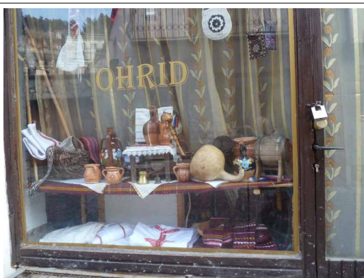
Traditional items on sale in Ohrid