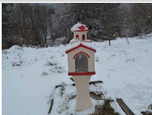
Pause for prayer at the top of the pass

Another plus about being in Ohrid was that there is a Catholic Church there with a Mass daily which I was able to get to on several occasions. The town is very picturesquely located on the edge of Lake Ohrid and has a long history, being strategically placed on the Via Egnatia, the main trading route between Istanbul and Rome. It was not without regret that I finally said goodbye and made for Bitola. Here I found there was also a Church with daily Mass and I arrived in time to attend it. Talking to the Priest afterwards I was surprised to find there were only 3 Catholic Churches in Macedonia and ironically 2 of them lay on my route, the Via Egnatia. He also told me I would not find another Catholic Church until Thessaloniki, the best part of 200kms away.