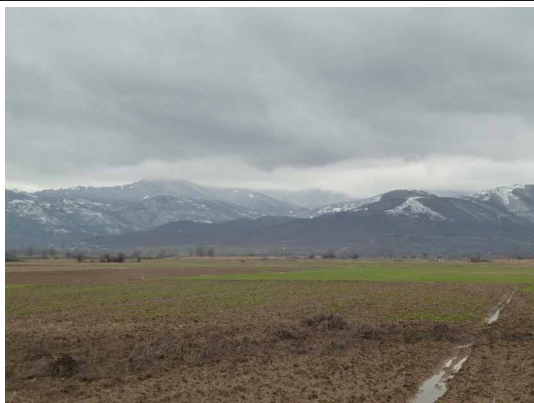
Countryside continues flat with mountains around the edge of the plateau .....

After the high mountain pass I described earlier, the countryside was a sort of flat plateau bordered by higher peaks. The Florina area has the 3 rd highest mountain peak in Greece. I was travelling south and eastwards and away from the mountainous area towards a lower plain and the coast at Thessaloniki. As I left the mountains it did start to be warmer. I left the town of Arnissa in beautiful sunlight and had no need of my wind-proof rain jacket for the first time.