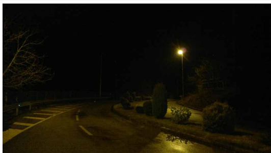
Crossing into Macedonia again .....