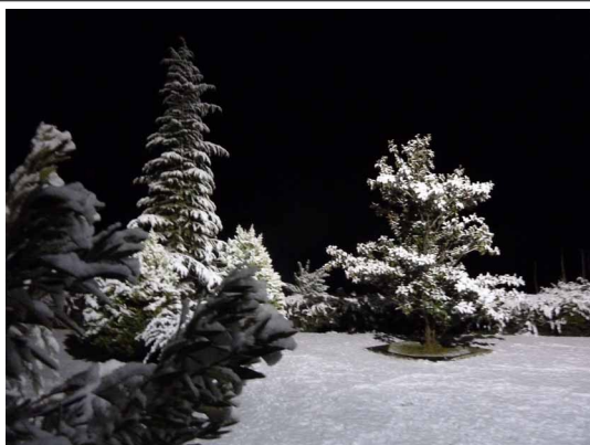
I was glad to be snug inside the hotel room

But as I approached Edessa the temperature definitely dropped and as I arrived it was down at 4 degrees. I found a hotel and within the hour snow was falling, big, thick flakes, the sort that don't melt. Later that evening when I looked out of my window, another Christmas card scene greeted me. Was I relieved I was in a lovely, warm, snug room.