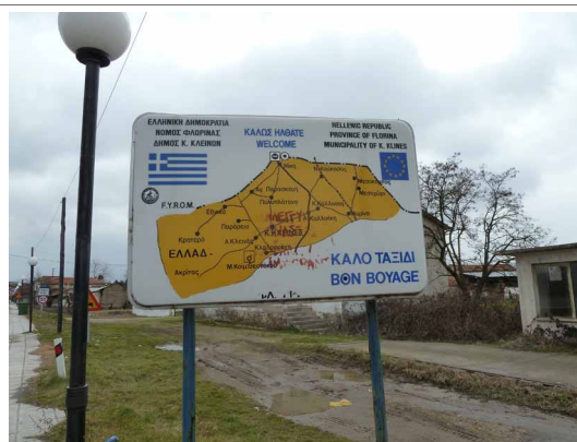
Fortunately it was – I am now in Greece!

It was quite a tough day, my first with a full rucksack, my longest day since restarting and don't forget I had had a break of 2 months. My fitness level had plummeted. By the time I was able to take my rucksack and boots off and lie down in my hotel room my body ached all over and my feet were complaining in no uncertain terms! The next day was no better, despite only walking half the distance and with only a daysack. The following day was just as bad. The weather continued very cold and to exacerbate matters there tended not to be somewhere to rest and have a coffee during the day. No matter how tired I was I could not rest for more than about 10 minutes at a time as I got too cold.