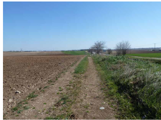
A brief respite from the tarmac road

But it wasn't just the weather that cheered my spirits and pulled me through. As has so often happened in the past, just when I start feeling really weary and dispirited and in danger of quitting, aid is sent: