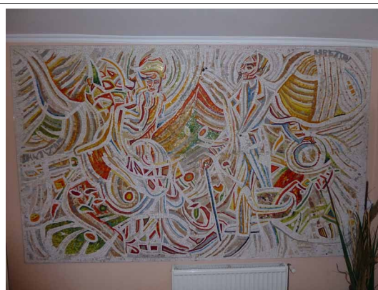
Interesting mosaic on the wall in the hotel at Bitola

Leaving Bitola the weather had worsened, colder and it was snowing lightly. I had no map of the route between Bitola and Greece so I rather hoped I was going in the right direction (remember how good I am at taking the 'scenic route'!).