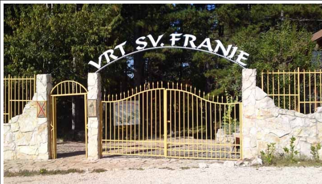
Saint Francis's Garden .....