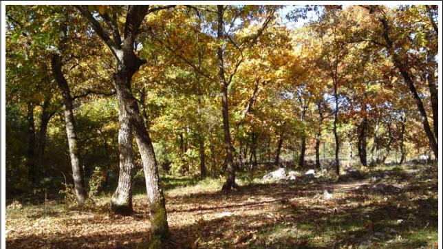
..... with autumn colours

Next day started chilly with low cloud. I went to the English Mass again, intending to visit Apparition Hill afterwards. By the time Mass was finished, the air was warm and the clouds had disappeared and it was again a glorious day (is this not too good to be true?). Off I went to the Hill, discovering it had been the right decision to turn back that first day – it was much further than I had anticipated. Given the number of pilgrims that come to Medugorje I had expected to find a nicely laid out, easy to walk path. Not a bit of it. You had to pick your way over the stones, rocks and boulders of the hill. The route was 'waymarked' by the lights which guided pilgrims ascending in the dark. The only saving grace was that there were no loose stones, these having already been dislodged by countless previous pilgrims. I regretted not having my walking boots on as my sandals were barely up to the job and I could have done with my trusty staff!