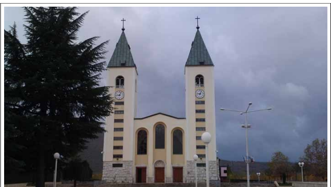
The Church of St James