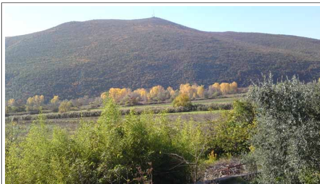
Hills in autumn colours