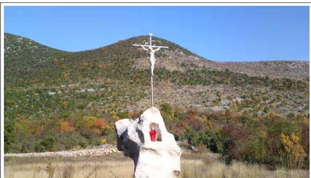
Pause for prayer en route

Eventually I reached Medugorje and made for Apparition Hill. The route led me away from the town and after some time I still seemed to be in among houses and rented accommodation and the occasional shop or cafe. I was getting quite tired and was conscious of approaching dusk so I turned back and headed for the Church (dedicated to St James, very appropriate for me!) which was very easy to find. There I said thanks for my safe arrival and then went to the information office. It was here I hit a slight snag.